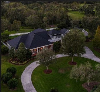
For Sale $2,200,000 11441 HAMMOCK OAKS CT LITHIA, FL