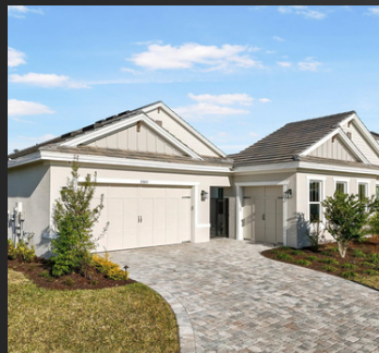
For Sale $1,200,000 33843 GALLEY WAY WESLEY CHAPEL, FL