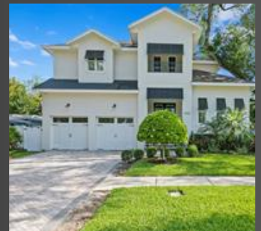
SOLD Buyer Agent $1,950,000 4528 W BEACHWAY DR TAMPA, FL

We can't talk about Luxury Real Estate in Tampa Bay without discussing condos. A condo surge has led the charge to our Luxury Market with over a 3X sold rate in comparison to single family homes. Wellness amenities have played a key in this market with rooftop lounges, spas, concierge services, and full gyms. High profile skyscraper projects are on their way to Tampa with ONE Tampa: a 42-story building, Pendry Tampa, and Ritz Carlton Tower which will reshape the Tampa skyline forever.