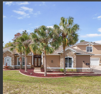
For Sale $1,125,000 11296 WARM WIND WAY WEEKI WACHEE, FL