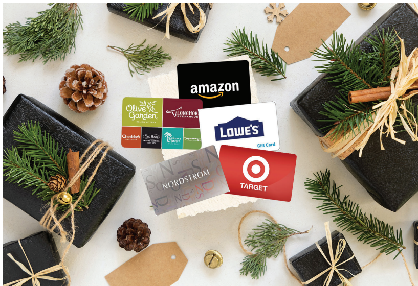
Gift cards for: Darden Restaurants, Amazon, Target, Lowes and Nordstrom

Register Online at TonyBaroni.com/contest before 5PM on Dec 19th