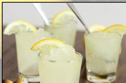
Honey and Vodka Lemonade Slush BY: KARI CLAGETT

Beat egg yolks, add milk then lemonade. Place in refrigerator. Beat egg white and whip cream. Fold the whipped cream into lemon mixture then fold in the beaten egg whites. Spoon into graham cracker crust, cover, and freeze overnight. Serve topped with whipped cream. Makes 6-8 servings. (can substitute fresh squeezed lemons for frozen lemonade)