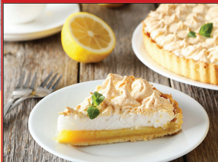
Frozen Lemon Pie BY: LESLIE BRUHA

Shaken & poured into a sugar rimmed martini glass with a lemon twist