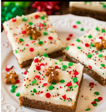
Delicious, soft, chewy, and can feed a crowd. (Serves 24)

Whisk together \frac{3}{4} cup sugar, \frac{1}{4} cup dark brown sugar, \frac{1}{2} cup melted butter, \frac{1}{2} teaspoon pure vanilla, \frac{1}{3} cup molasses. Then, mix in 1 egg, 2 cups of flour, 2 teaspoons of baking soda, 1 tablespoon of cinnamon, \frac{1}{2} teaspoon of ground ginger, \frac{1}{4} teaspoon ground nutmeg, \frac{1}{4} teaspoon ground cloves, \frac{1}{2} teaspoon salt.